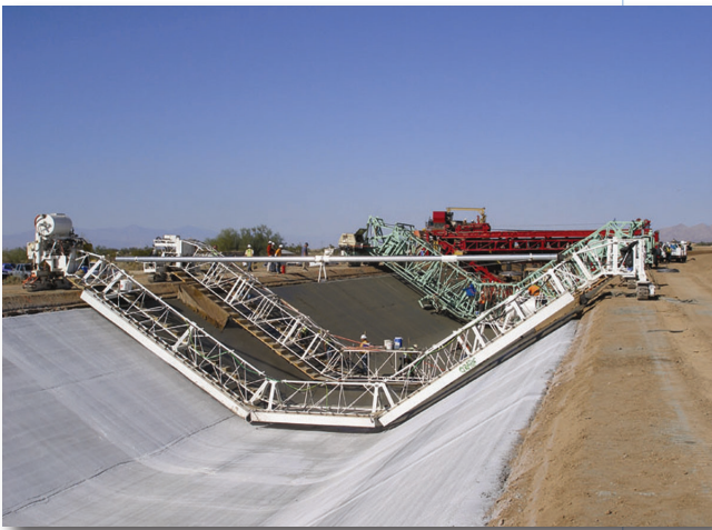
Lining the All-American and Coachella canals conserves approximately 80,000 acre-feet of water annually for use by the Water Authority.

Under the agreement, the Water Authority receives at least 77,700 acre-feet of conserved water per year for 110 years. The Water Authority also can receive up to an additional 4,850 acre-feet of water annually from the projects, depending upon how much water is used for environmental mitigation. The rest of the conserved water from the projects belongs to several bands of Mission Indians in northern San Diego County – known as the San Luis Rey settlement parties – to settle a water rights dispute with the federal government and decades of litigation.